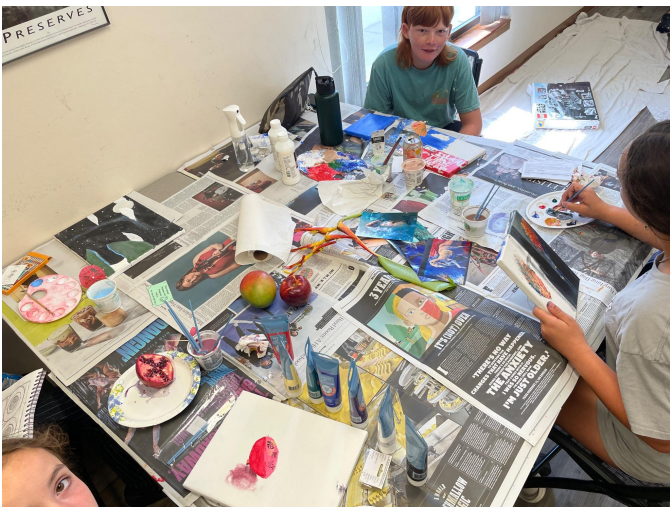
Children painting in the library with acrylics.

Exploring drawing with vine charcoal. This is a new concept in drawing for them.