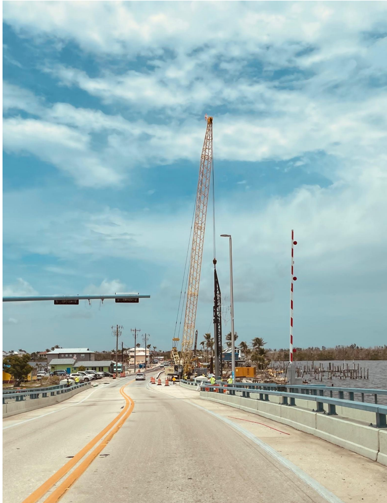
Progress at the Bridgewater Inn site.