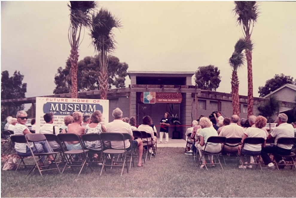
Ribbon cutting ceremony for the opening of the museum in 1990