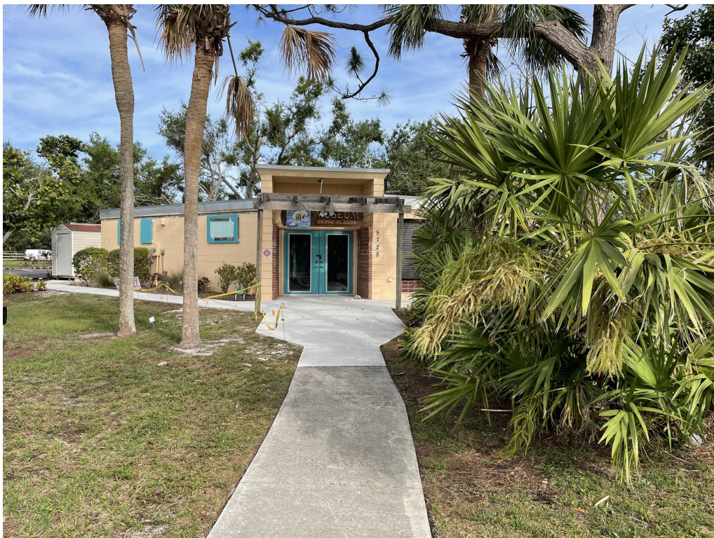
The museum today